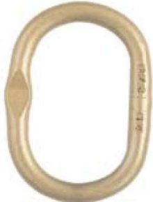
7/16" through 1-7/32" have Engineered Flat