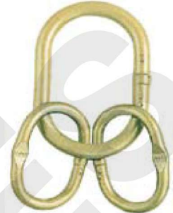
11/16" through 1-7/32" have Engineered Flat